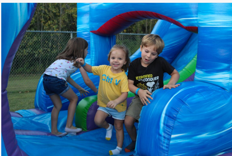
After getting out of the bounce house obstacle course, students run to do it again.