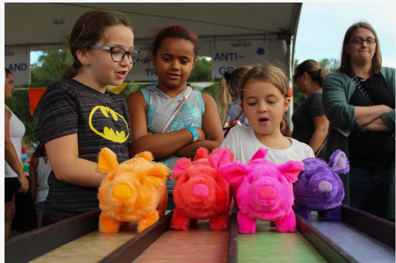
Three students watch their pigs race to the finish line in the game tent.

The Fall Fun Fair was held on Friday the 13th. Families and students spent the night playing games, and bouncing in bounce houses. There were many different things to do such as a photo booth, a raffle, and a teacher dunk tank.