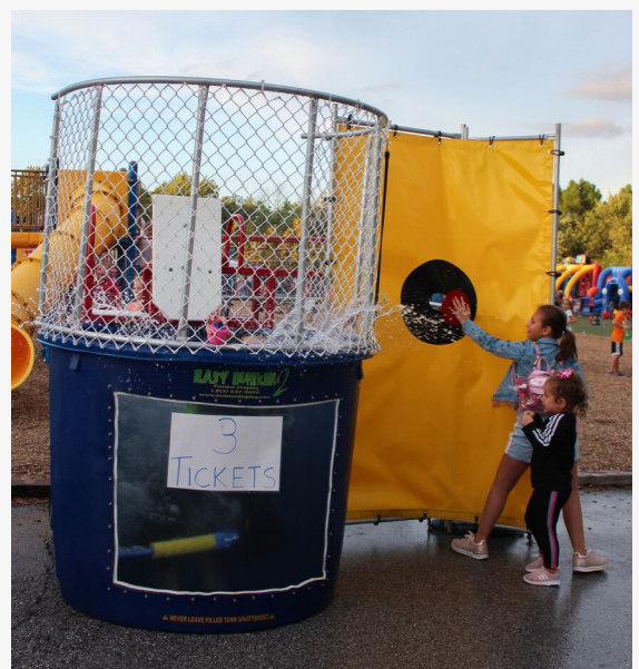
Two students run up to the dunk button to dunk their teacher after a younger student missed the target.