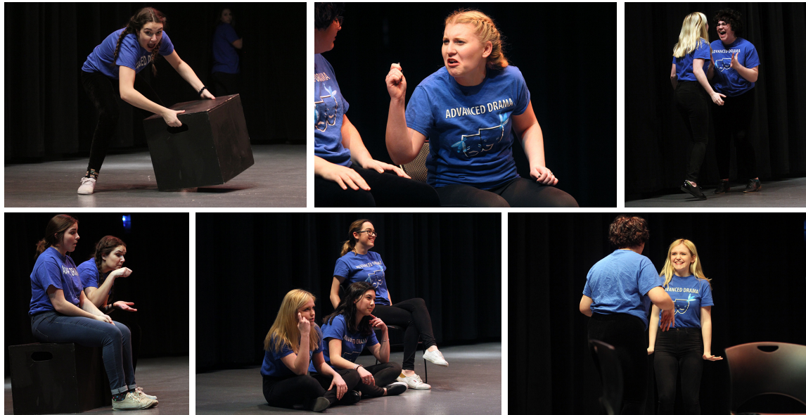
The Advanced Theater class performed their sketch shows on Feb. 8. They split up into three groups and each group

performed several sketches that they had been working on in class.