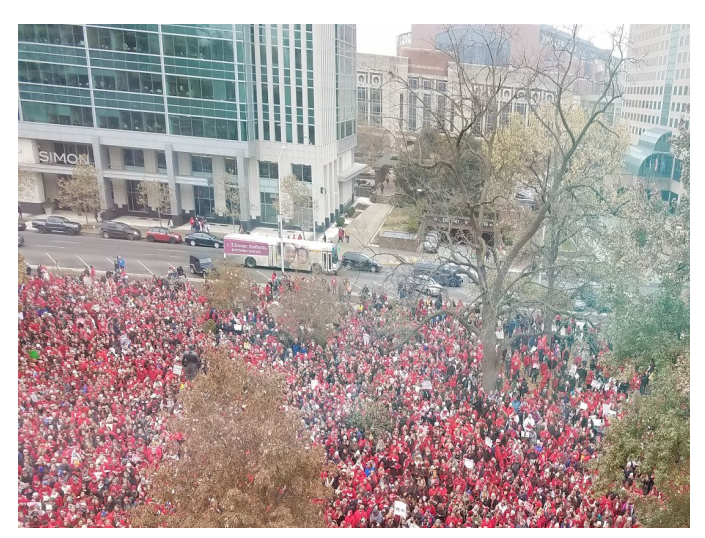
View from Senator Niemeyers' window, we all gathered to look after our meeting!