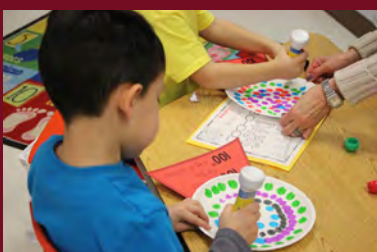
Students participate in 100th Day of School activities.