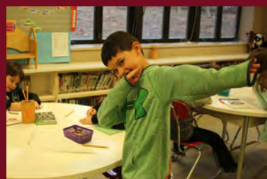
Some students had a little extra fun while coloring.