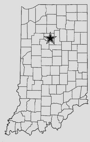
IHSAA - Pure Spirit. Pure Sport!